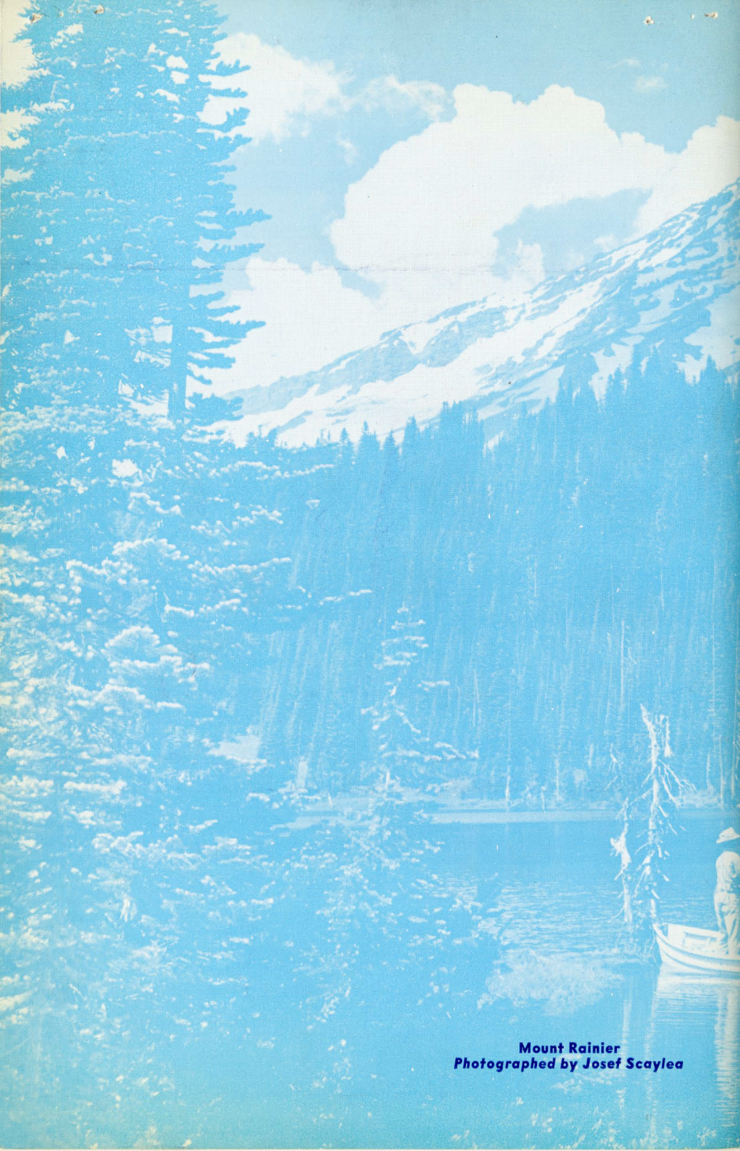
Mount Rainier