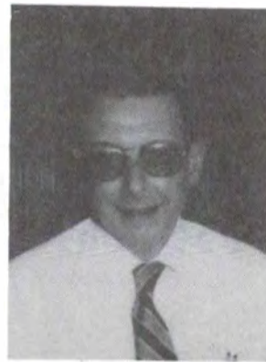
Charles A. Coulomb