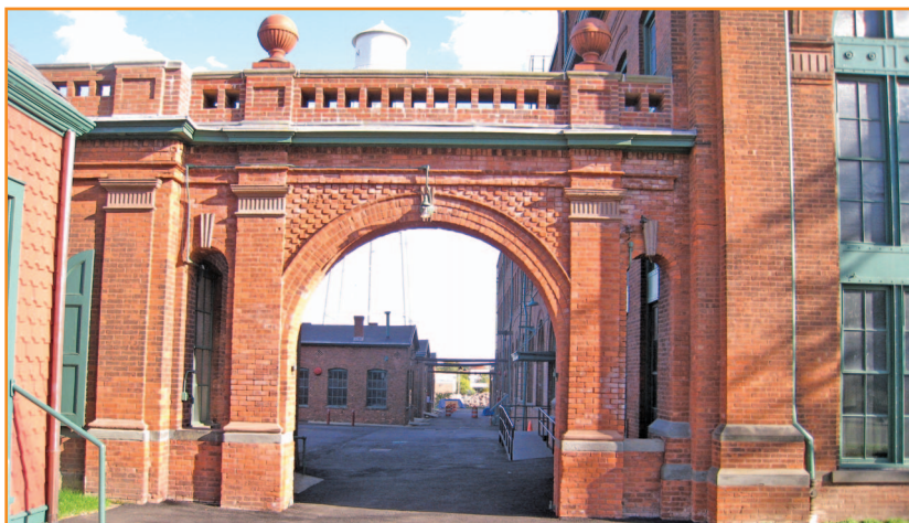
figure 13. Main entrance of the Edison laboratory complex, with the main building on the right and the chemistry building in the background.