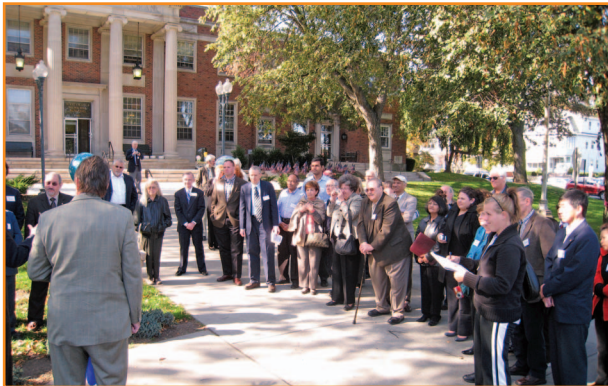
figure 16. Attendees at the milestone dedication and plaque unveiling in front of the West Orange municipal building.