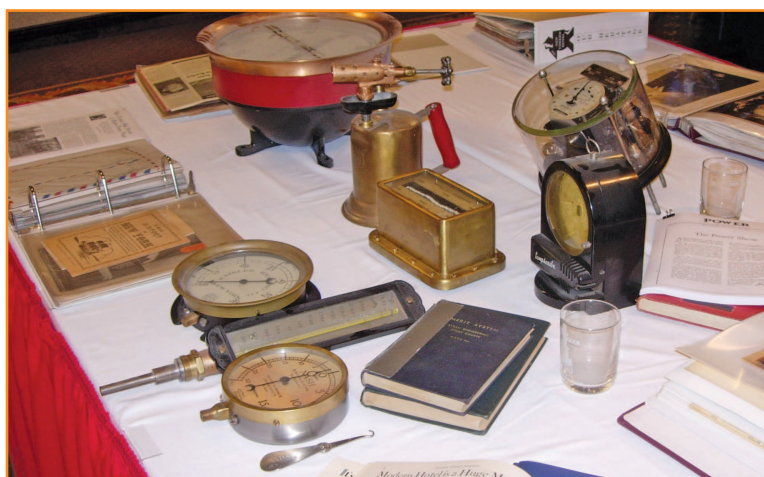
figure 9. Display of artifacts concerning the long history of the New Yorker Hotel.