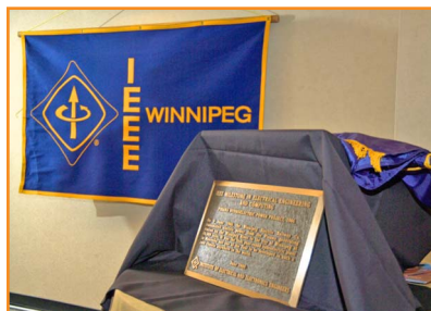
figure 5. The Pinawa milestone plaque after dedication and unveiling.

Friends of Old Pinawa; and President El-Hawary.