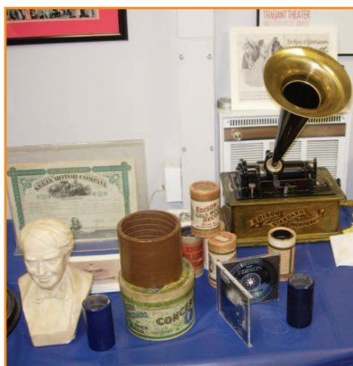
figure 14. Some of the Edison artifacts displayed by Charley Hummel at the dedication ceremony.