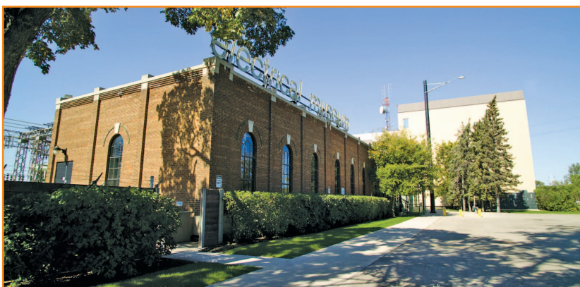
figure 2. Manitoba Electrical Museum & Education Centre, with the former head office of Manitoba Hydro in the background (photo courtesy of Mario Palumbo CPA/Manitoba Hydro).

On 9 June 1906 the Winnipeg Electric Railway Co. transmitted electric power from the Pinawa generating station on