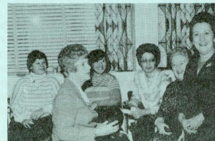
Field Services Dept. was well represented.