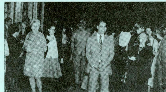
So was everyone else.