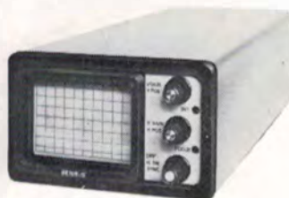
NEW! RA850 5" version of Model RA840-A

BROAD SPECS: Operation to 500 KC. Input sensitivities to 4mv/cm.