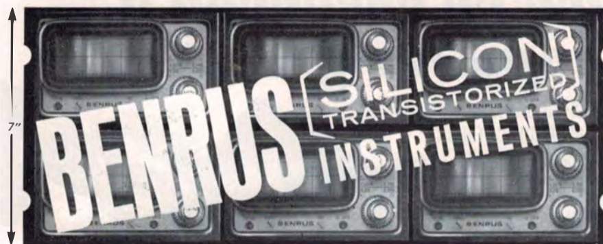
Model RA840-A 3" OSCILLOSCOPE FOR PANEL MOUNTING IN SYSTEMS AND BENCH USE