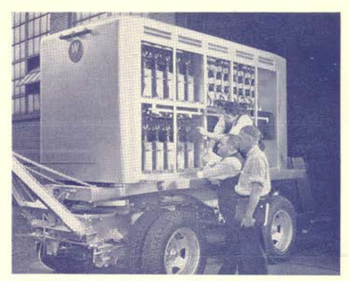
Portable Capacitor Units play an important part in emergency operation and their application will be discussed in the first session on Monday.