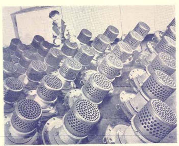
"The Ignitron"—one of the types of electronic tubes to be discussed in the Wednesday afternoon conference.