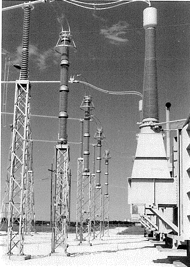
Picture of MOSA for 500kV system used in Canadian electric company in 1979