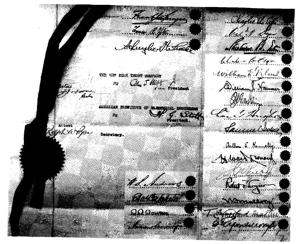
Fig. 4. Signature Blocks from Amended and Substituted Deed of Gift Dated 1908 Reestablishing Terms for the Edison Medal.<sup>5</sup>

the revised by-laws and new rules. (Edison Medal Committee, 1910) Later, the AIEE appointed a jury of 24 members to select the recipient of the award. (Presentation to Nikola Tesla, 1917)