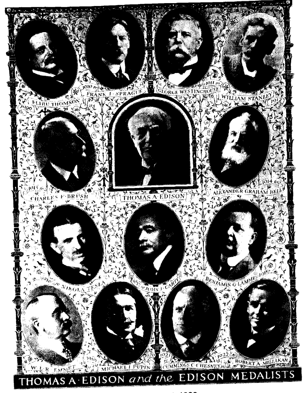
Fig. 8. Edison Medal Winners 1909 through 1922. (Tesla Memorial Society, 2009b)

The original award included a gold medal, bronze replica, small