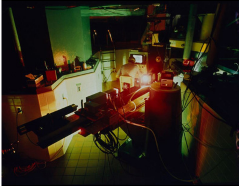
In this photo of the KORAD laser firing from beneath the Shane Telescope at Lick Observatory, astronomer Joseph Wampler can be seen at the monitor in the background guiding the telescope.