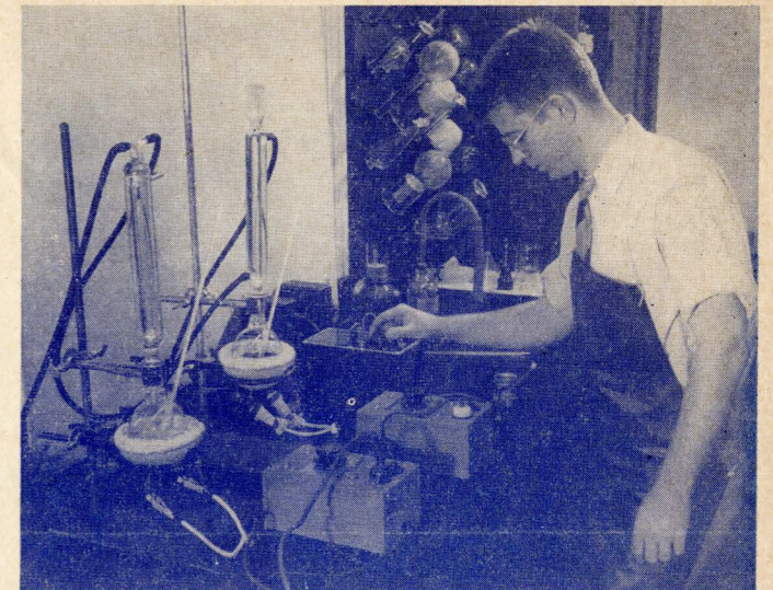
Laboratory Scene — Southern Research Institute

Hotel Reservations —Those who will attend the meeting should make reservations by filling in and mailing the enclosed advance Registration and Hotel Reservation Card as early as possible. Arrangements have been made with the principal hotels in Birmingham for a sufficient number of rooms at regular commercial rates for the estimated attendance, but due to the unusual demand for accommodations