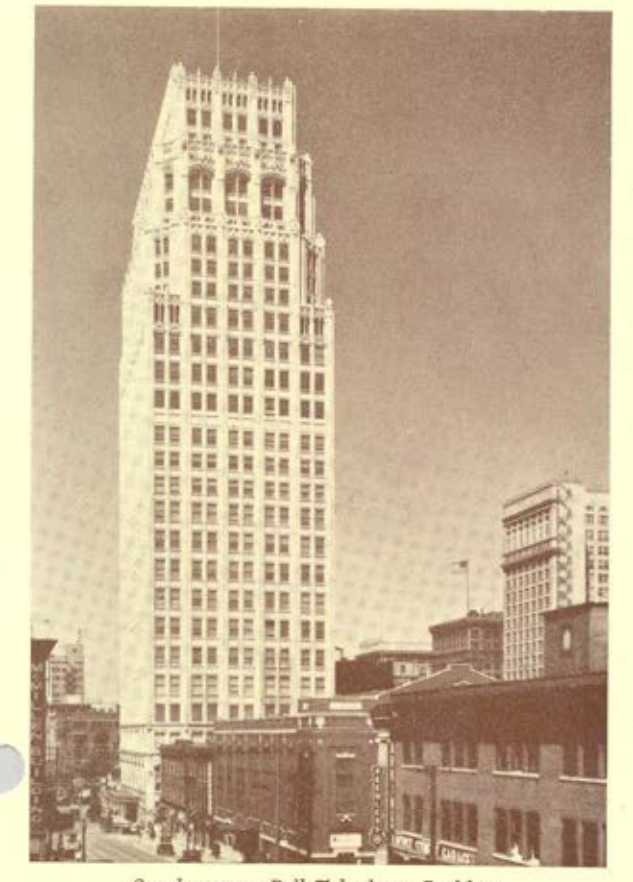
Southwestern Bell Telephone Building

A visit to the Bell Telephone building will afford an opportunity to inspect a large telephone power plant, a large