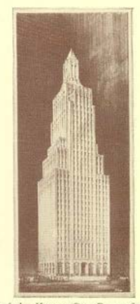
New Building of the Kansas City Power & Light Company

The a-c. system consists of seven 13,200/4,400/2,550Yvolt, three-phase, four-wire automatic substations. These stations located in various parts of the city are architecturally designed to conform to the type of district in which they are located. Interior designs follow usual practise, but with such additional features as comply with latest ideas. Stations of interest in this group are: Substation R of residential type using reinforced concrete for switch barriers and regulator bays; Substation A of residential type using "Ha-dite" concrete barriers; and the latest Substation H located in a newly developed business and apartment district, with the station exterior designed to conform with the general architectural plan of the district. The interior design is in artistic agreement