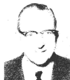
by Jim Hill, The EMXX Corp.