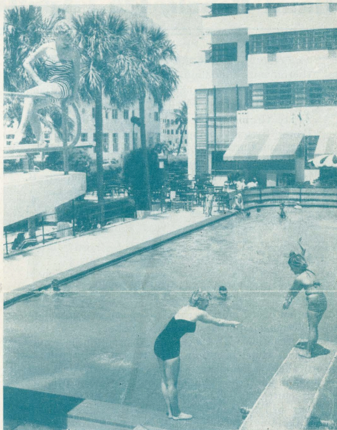
The MacFadden-Deauville Hotel

Registration Fees —Members and nonmembers should register in advance by filling in the advance registration card sent with this announcement. A registration fee of $2.00 for members and $3.00 for nonmembers will be required. Enrolled Students and families of members, no fee.