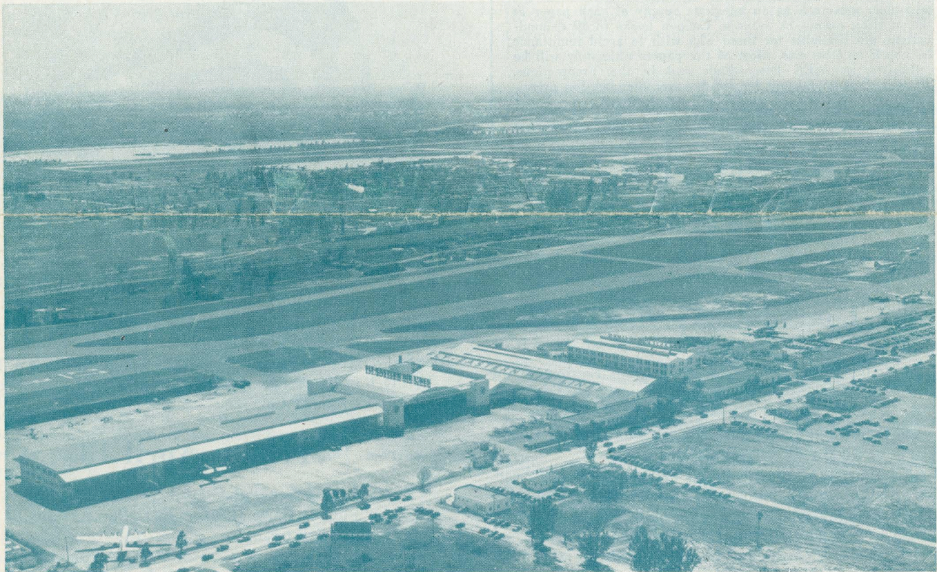
International Airport, Miami, Florida

Headquarters The MacFadden-Deauville Hotel