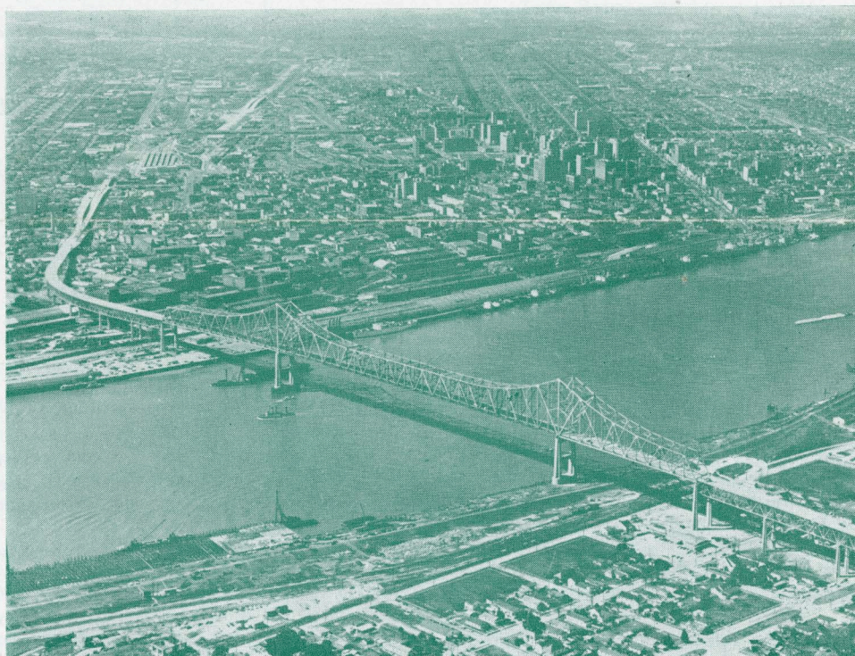
New Orleans, Louisiana

New Orleans plays host to Districts 4 and 13 for their 1961 Joint Meeting . Visitors always enjoy New Orleans "Old World Charm" and world-renowned cuisine.