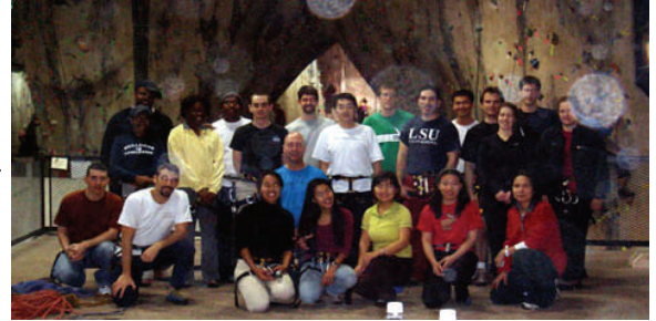
Boston GOLD and PACE members at the Rock Climbing Event.

The day ended when all of the IEEE members and guests were thrown out of the gym because it was closing. A five hour event, inclusive of the two hour lesson, made this as an extremely successful event