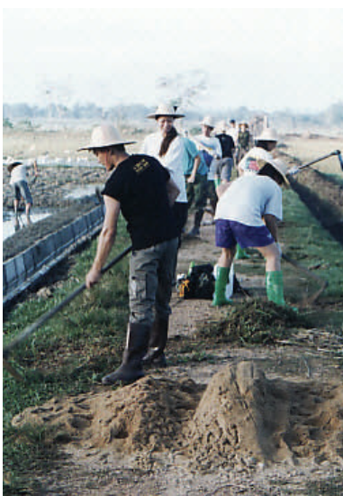
Developing a more efficient irrigation system.

team reflections and discussions, that we realized that what we had experienced over the weeks was going to challenge and possibly change our mental frameworks and belief system. In a nutshell, the team gained two important insights from the expedition: (a) the value of living with the basics (material-wise) and be content with it, and (b) what it means to live with humility, putting others before ourselves. One of the participants mentioned, "I used to think to myself that I will earn big bucks after I graduate with an MBA. But now I can't even hold my 'chan co' ('spade' in a Chinese dialect) properly. The old lady, probably thrice my age, could dig the soil faster and endure further than I could. How proud I was in the past. This is truly a humbling experience for me." The insights we gained are some character-building principles that have been repeatedly emphasized over the centuries by teachers, such as Confucius, Mahatma Gandhi, and Mother