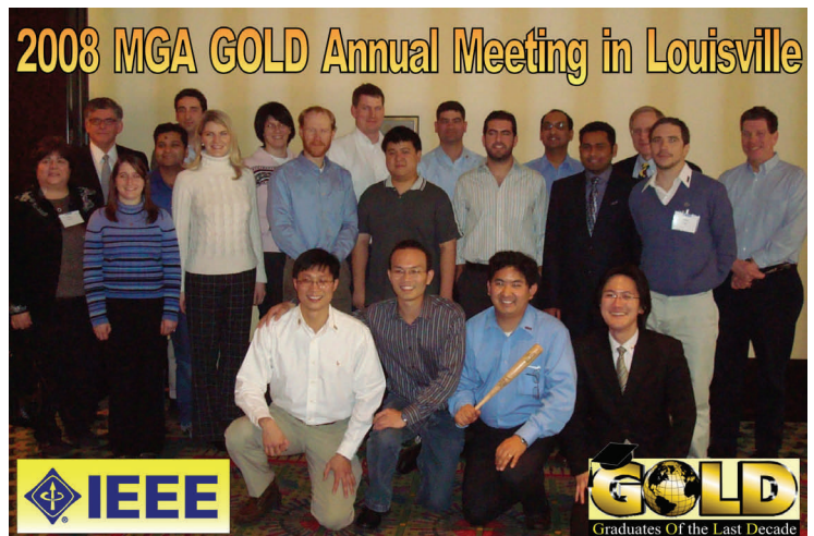
Greetings from the 2008 MGA GOLD Committee

The 2008 Member and Geographic Activities (MGA) GOLD Committee has an excellent composition of volunteers. They are all filled with positive energy, enthusiasm and passion. Their vision is to increase the value and worth of IEEE services and programs to young professionals and recent graduates. Additionally, their mission is to develop programs and foster relationships to provide tangible value to members, pro-