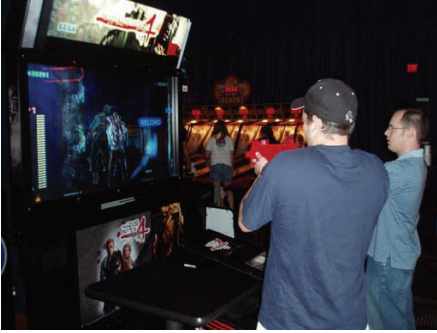
Students enjoying games at Dave and Buster's.