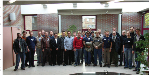
Participants of the joint Benelux and Germany GOLD Weekend.

Social and cultural activities were part of the program as well. We visited the