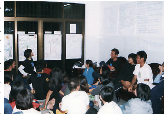
A reflection & facilitation session.

IEEE GOLD with established humanitarian organizations to explore avenues for our young members to participate in humanitarian projects. As a start, GOLD will partner with humanitarian organizations, like EWB (Engineers Without Borders) to host a 'Engineers and Humanitarian causes' work-