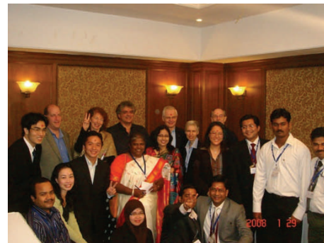
Leaders of today meet leaders of tomorrow.

There were more touching moments too, as delegates shared cultural aspects that transcend geographical barriers. Songs from different countries were sung during the bus rides; I taught a local GOLD committee member basic salsa moves and we did a performance after the closing dinner; a Hong Kong delegate also showed some Chinese martial arts moves.