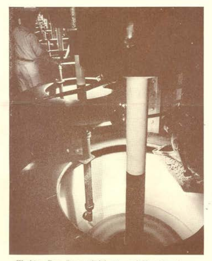
Washing Raw Sugar. California and Hawaiian Sugar Refining Corporation, Ltd.

Convention headquarters will be at the Fairmont Hotel atop Nob Hill and overlooking San Francisco Bay and Treasure Island. Accommodations are available at other hotels at a variety of prices. It is extremely important that reservations, if not already made, be made immediately. An application for this purpose is attached to the enclosed circular on Hotel Accommodations.