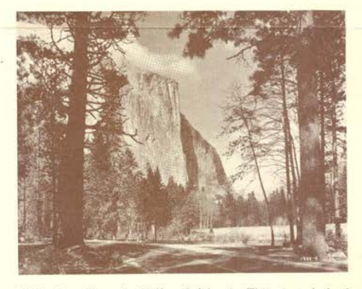
El Capitan, Yosemite Valley, California. This giant shaft of stone rises a sheer 3,604 feet above the floor of the Valley.

In Southern California the many beaches, the movie studios, and other attractions lure many tourists. Oregon, Washington and British Columbia. likewise contain many points of interest. Visitors from east of the Rockies may well include Grand Canyon, Boulder Dam, Grand Coulee, Glacier Park or Yellowstone in their intineraries.