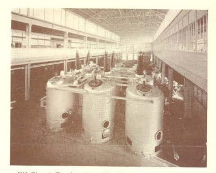
Oil Circuit Breaker Assembly Floor of Pacific Electric Manufacturing Company