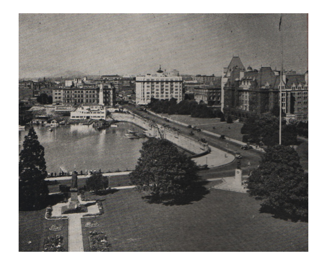
Two pictures of the Inner Harbour and downtown section of Victoria. Photo at right was taken in the early 90's. Note the bridge and mud flats to the right of the bridge. Below is the same section today. A substantial causeway has taken the place of the bridge, and the stately Empress Hotel now stands on what were once unsightly mud flats.