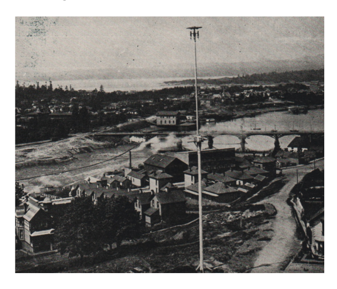
Photo of Early Victoria showing one of the 150 foot lighting masts referred to in this article.

This installation called for the erection of three 150-foot masts, each carrying four or five double are lamps and were expected to light the whole of the more thickly populated part of the city. The agreement was confirmed by by-law in July, 1883, and the installation was ready for service in the following December.