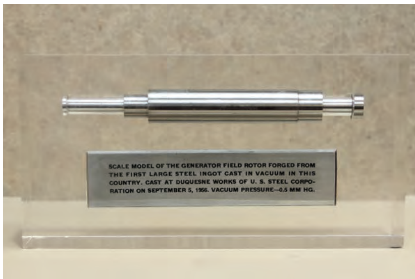
Scale model of the generator field rotor forged from the first large steel ingot cast in the U.S., from Bernard Queneau's private collection.

Steel's mills and research laboratory lost a great advantage in not developing the basic oxygen furnace at that time. In an effort to improve the Bessemer process, the research laboratory had developed a side-blown Bessemer, called a Turbohearth, and actually put one in at South Works, and operated it for nearly a month. But within a few days, the lining had been all burned out by the use of oxygen being fired right across at the side wall. Now, why didn't one of us think of a vertical line? I include myself because I looked at this furnace, but I wasn't directly involved. Later, the Austrians placed the oxygen lance vertically, to blow down on the steel, and thus developed the basic oxygen furnace. We had to wait for the oxygen to do the natural thing of blowing down on the steel, and that became a worldwide standard and sounded the knell for the basic open hearth and Bessemer furnaces.