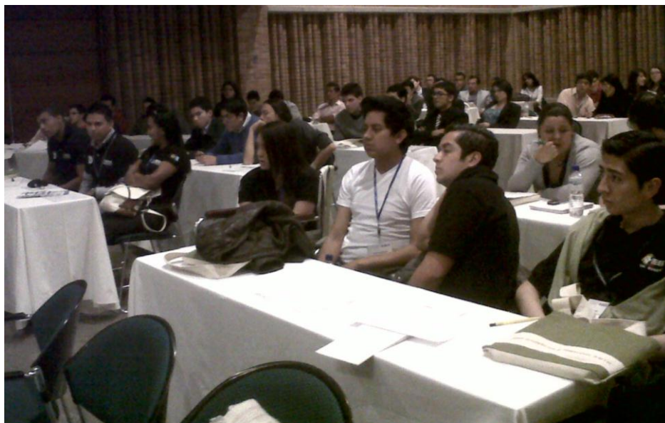
Pictured: GOLD Summit attendees

Keeping in mind the vision that nowadays IEEE is working on, advancing technology for the humanity, the organization included "IEEE humanitarian technology