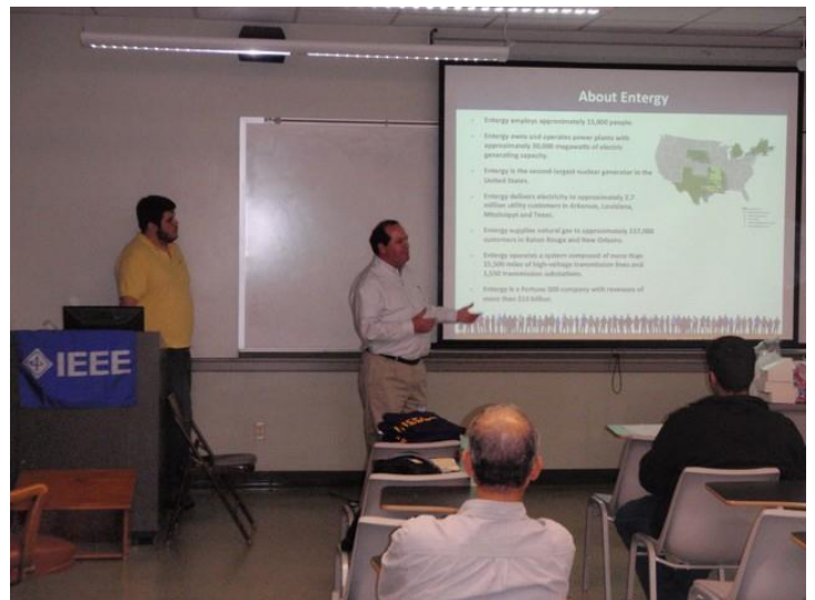
Pictured: STEP Event at Baton Rouge, Louisiana, USA