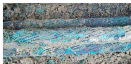
Pictured: Underground Cables with Corroded Concentric Neutrals

lacking a concentric neutral return path as a result of corrosion.