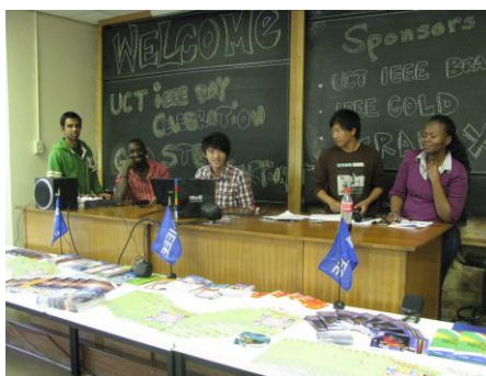
Pictured: Local organizing committee preparing for the event