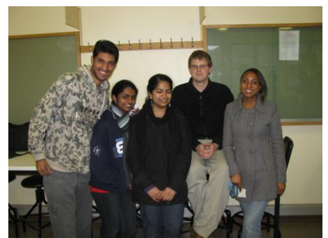
Pictured: Group of IEEE members and final year electrical engineering students.

rail and Eskom for the heavy current students as well as representatives from the South African Institute of Electrical Engineers (SAIEE). Some 60 students, 5 staff from the electrical engineering department and 13 industry guests enjoyed the interactions over good food and drink.