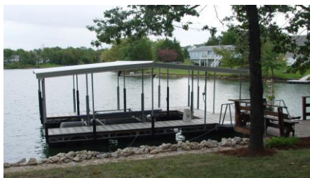
Pictured: The dock where the accident occurred

Six teenagers were enjoying a cool evening in an outdoor hot tub in a home near a small lake. Several of the teenagers decided to exit the hot tub and run out onto a small dock and jump into the lake.