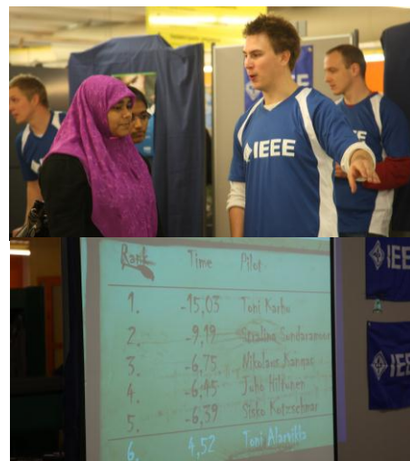
Pictured: Professional instruction for all aviators (above), Live results for the helicopter flying (below)

At the moment, video footage of the event is being edited with the aim to publicize it in IEEE.tv. Again we would like to express our gratitude towards everyone who helped support this event and in doing so were part of the success of this event. For more information on the event or on what is going on in our hemisphere please visit http://www.ieeegoldfinland.org