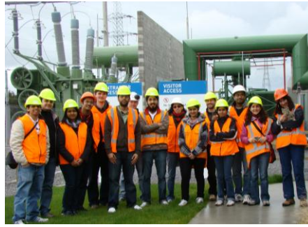
Pictured: Attendees enjoying the tour

On reaching the geothermal power station, we were first inducted onto the site with a safety briefing followed by an introduction of the plant, its capacity, main features and the various steps involved in geothermal extraction. This was followed by a visit to the steam separation area which included the rock muffler, acid dosing pumps, re-injection pumps, high, medium and low pressure separators, cooling water tower, the turbine hall and the local control room. Several stops were made to explain the functionality of various plant equipment and to answer questions. The