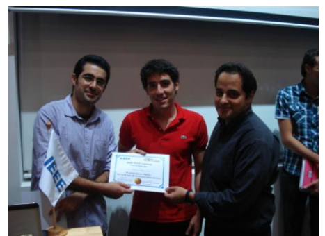
Pictured: Graduate IEEE member receiving his Award