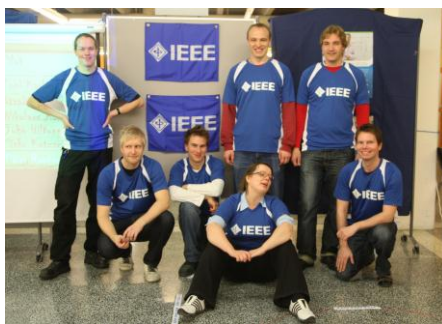
Pictured: The organizing team