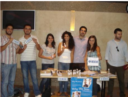
Pictured: AUB Student Branch Committee and Volunteers

The STEP event is a standardized yet localized program for facilitating the transi-