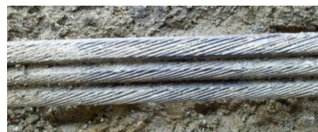
Pictured: Normal Underground Cables with Good Concentric Neutrals

These tests along with other testing indicated that several sections of underground cable around the lake and dock were