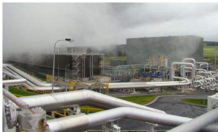
Pictured: Nga Awa Purua Geothermal Power Station

ing brine is then 'dosed' with sulphuric acid to prevent the deposition of silica in the pipes and equipment. Lower pressure steam is then separated from the dosed brine in the Intermediate and Low Pressure Separators. The High, Intermediate and Low pressure steam is then 'scrubbed' (cleaned) to remove harmful gases and sent through to the turbine to generate electricity. The steam, after passing through the turbine is then condensed and pumped through to the cooling tower for further cooling. Some of the cooled water is recycled and fed into the condenser to condense the steam and the rest is reinjected back into the ground through a number of re-injection wells.