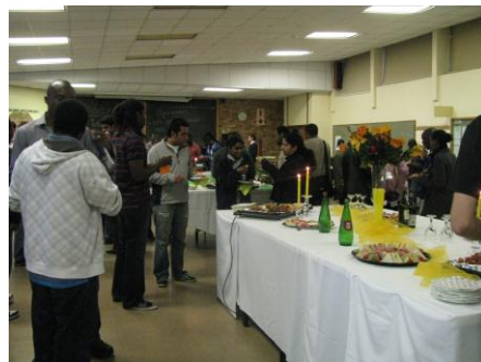
Pictured: Audience socializing over food and drink

The main portion of the evening was for the graduating students to socialize with invited guests from engineering companies in Cape Town. This included Peralex and Altech UEC which focus on electronics, Cape IT Initiative and Korwe Software catering to the software engineers, Metro-