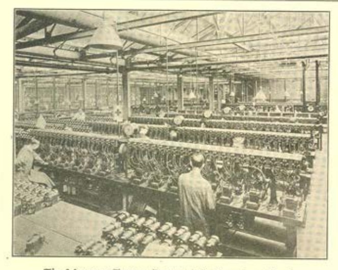
The Magneto Testing Room of the American Bosch Magneto Corporation, Springfield, Mass.

long at the top, containing 200,000 cubic yards of rock fill and 1,600,000 cubic yards of hydraulic fill, will when completed be one of the largest earth dams in the country. Cobble Mountain Reservoir when completed will be capable of supplying 55 million gallons of water per day. Water will be piped through a tunnel, 8000 ft. long and 10 ft. in diameter, to supply a power house with an average head of 420 ft. of water capable of generating 33,000 kilowatts total capacity. The estimated cost of the power house alone is $1,100,000. The power house, dam, and tunnel together will cost approximately $3,188,000.