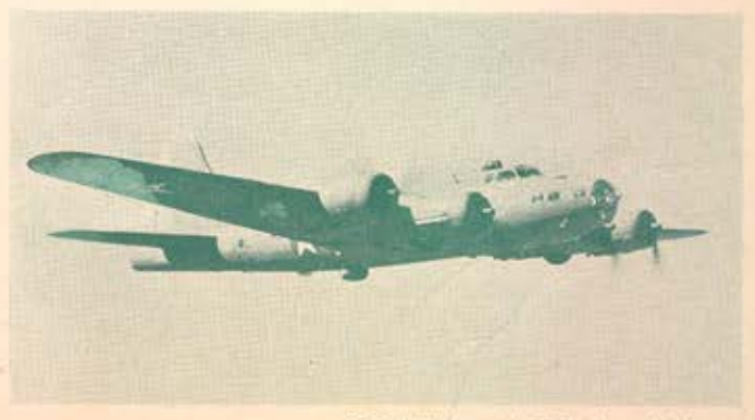
Official Photograph, U.S. Army Air Forces Aerial View of the B-17 Flying Fortress