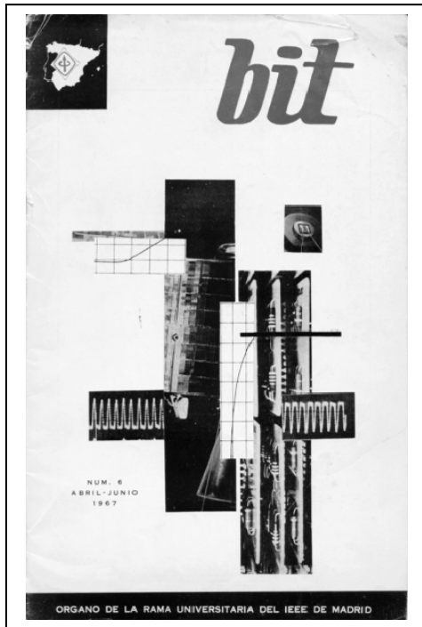
Figure 1. Image which shows the cover of the Journal "bit" in 1967.