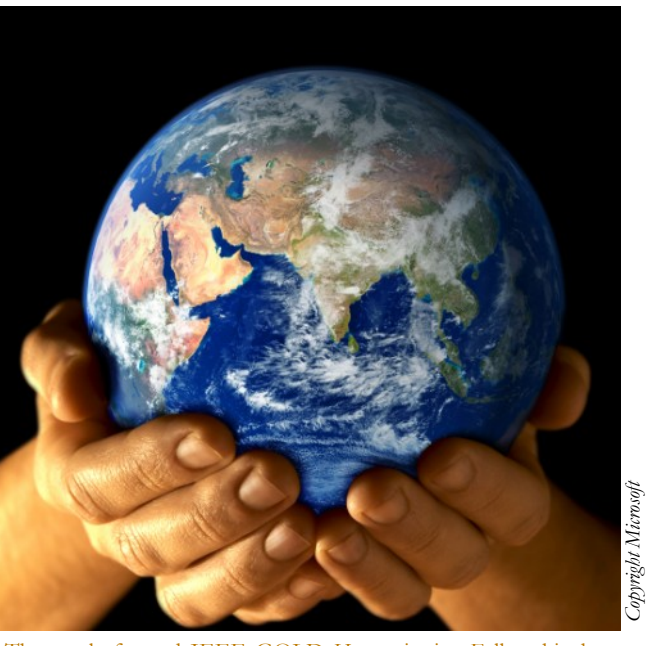
The newly formed IEEE GOLD Humanitarian Fellowship has given out US$30,000 in grants to humanitarian technology proiects

"The return on investment is enhanced standard of living, new relationships. and new understanding between the developing and developed communities."