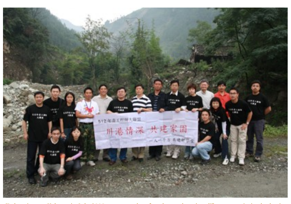
Delegation to Sichuan in July 2008, two months after the earthquake. The mountain in the background was believed to be the centre of the massive earthquake.

To meet the financial commitment of the project, the Alliance launched a fund-raising program called "One Square Meter Per Per-