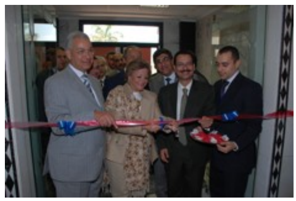
Inauguration of the 7th Egyptian Engineering Day. From left: H.E. Minister of Higher Education, H.E. Minister of International Cooperation, H.E. Minister of State for Administrative Development and EED Honorary Chairman

If you have never been to EED, then to give you a basic idea: it is an event where